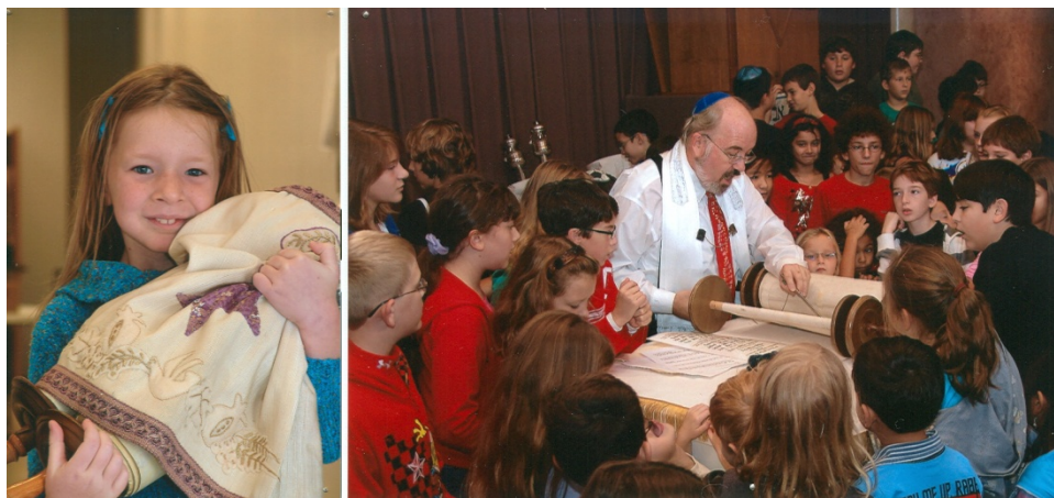
Pictures of a Sefer Torah being paraded at the holiday of Simchat Torah and being read on the bimah .